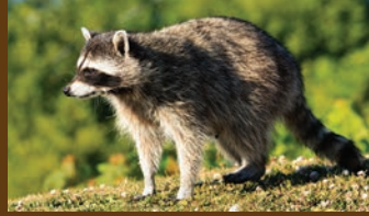
Raccoon ( Procyon lotor ) A bandit-faced, nocturnal mammal that will eat just about anything.