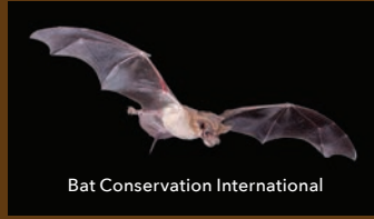
Mexican Free-Tailed Bat ( Tadarida brasiliensis ) Visitors flock to downtown Austin to catch a glimpse of 1.5 million of these little creatures that reside under the Congress Ave. Bridge.