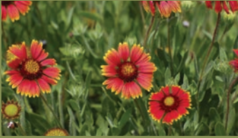
Indian Blanket ( Gaillardia pulchella ) Blooms April - June