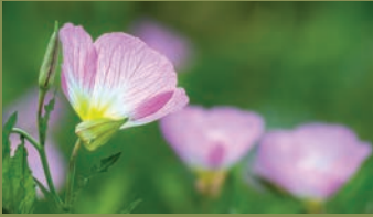
Pink Evening Primrose ( Oenothera speciosa ) Blooms March - July