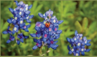
Bluebonnet ( Lupinus texensis ) Blooms March - May