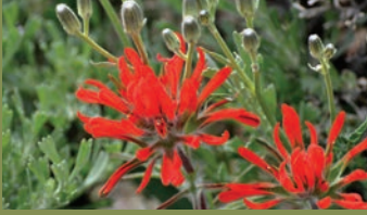
Indian Paintbrush ( Castilleja indivisa ) Blooms March - May