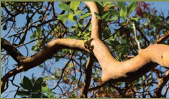
Madrone Tree ( Arbutus xalapensis ) Scattered throughout Sweetwater, the oldest of this relict species (approx. 800 years old) resides at the trailhead on Pedernales Summit Pkwy, after the bridge before Creekside.