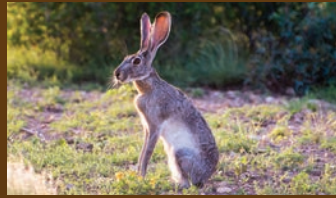
Jack Rabbit ( Lepus californicus ) Most active at night, the jack rabbit can run speeds up to 30 MPH and jump about 20 feet.