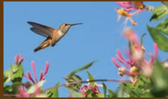
Hummingbird ( Colibri thalassinus ) Can hover in mid-air at a wing-flapping rate of around 50 times per second.