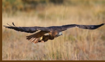
Red-Tailed Hawk ( Buteo jamaicensis ) The most common hawk in North America, usually seen soaring in wide circles high over a field.