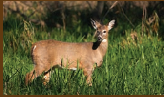
White Tailed Deer ( Odocoileus virginianus ) The most popular large game animal in the U.S.