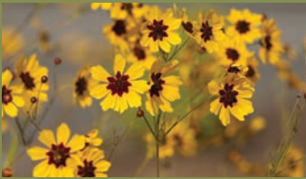
Plains Coreopsis ( Coreopsis tinctoria ) Blooms April - June