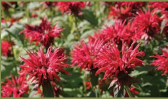
Bee Balm ( Monarda citriodora ) Blooms May - July