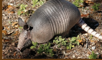
Armadillo ( Dasypus novemcinctus ) These barrel-shaped animals are the official state small mammal of Texas.