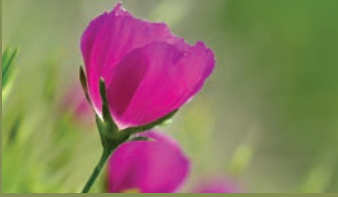
Winecup ( Callirhoe involucrata ) Blooms March - May